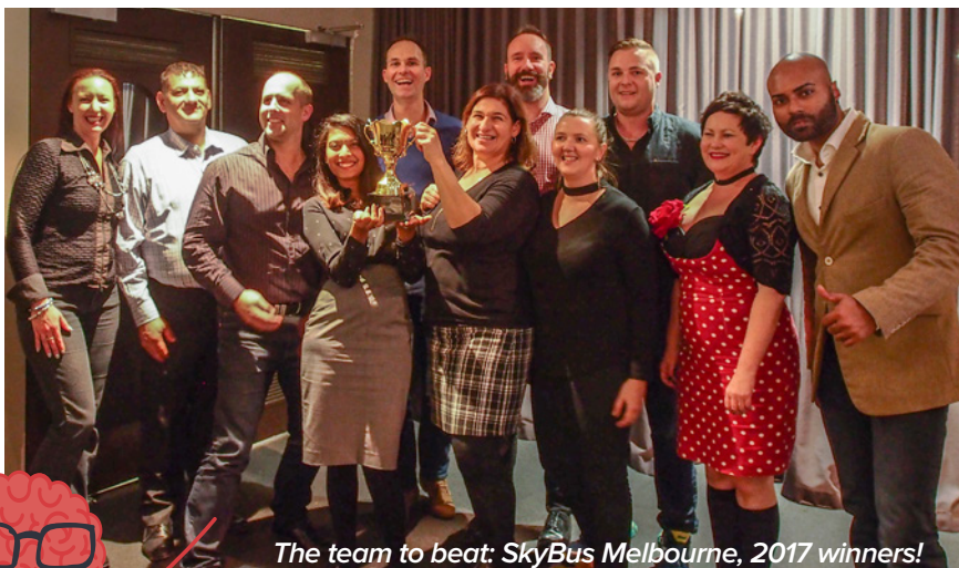
The team to beat: SkyBus Melbourne, 2017 winners!